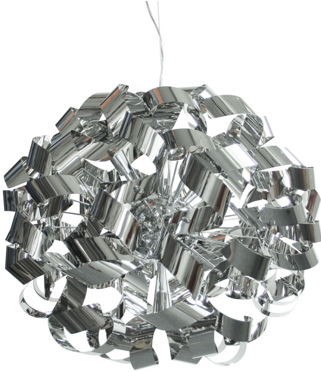
9 Light Pendant, Polished Stainless Steel Ribbons

Height 24 Width/Length 24 Depth 24 Weight 10