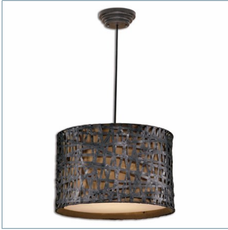
ALITA, 3 LT PENDANT