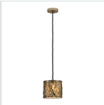
ALITA CHAMPAGNE, 1 LT MINI PENDANT