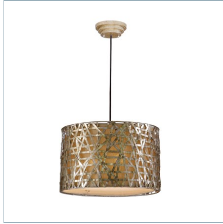
ALITA CHAMPAGNE, 3 LT PENDANT