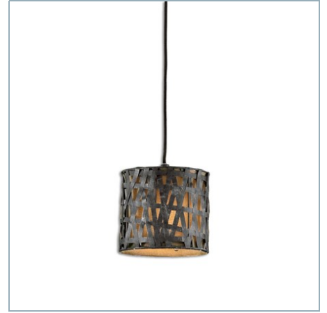
ALITA, 1 LT MINI PENDANT