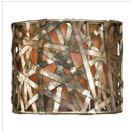
ALITA CHAMPAGNE, 1 LT WALL SCONCE